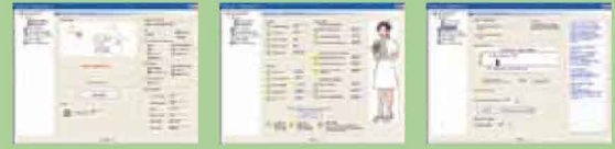
FULL STATUS MONITOR